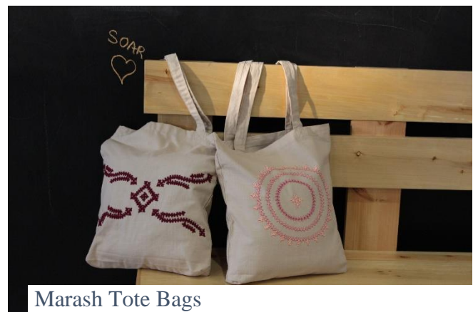
Marash Tote Bags