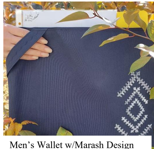
Men's Wallet w/Marash Design